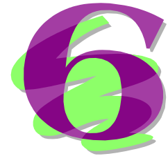
#6 heading for #1

in the 4CSF, its success is converted to a point system, and each time we exceed our goal additional points are earned. Additional points are earned for Distinguished Clubs and Distinguished Areas.