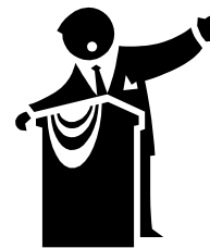
Club President presides over meetings of the Club and the Executive Committee.